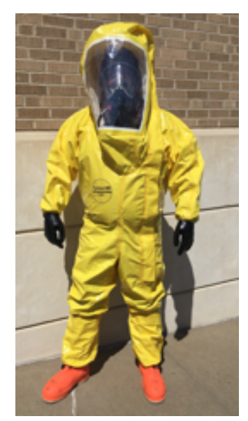
40 Hr HAZWOPER HazMat Technician